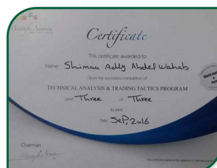
Forex Certificate by Mostafa Na...